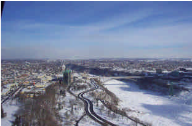
Looking North - Downstream and the Rainbow Bridge