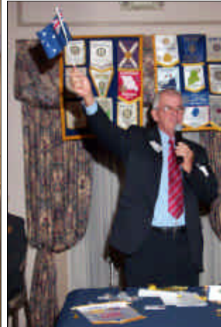
DGH Ray Brand, Dist 9630. Brisbane Australia invites all to the Rotary International Convention in Brisbane, Australia, June 1-4, 2003