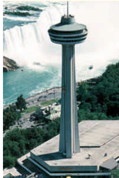
Skylon Tower