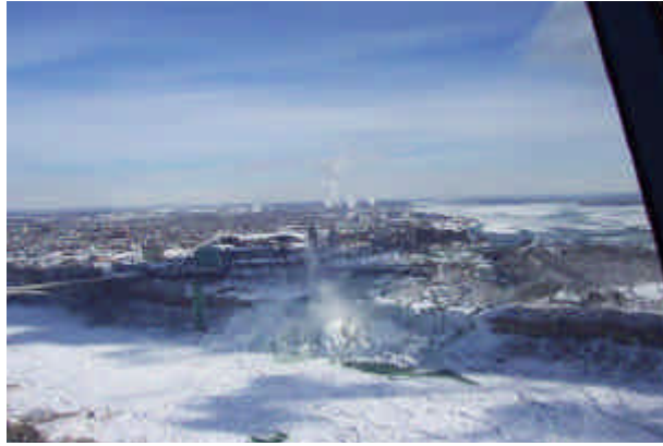
Looking East— The American Falls and USA