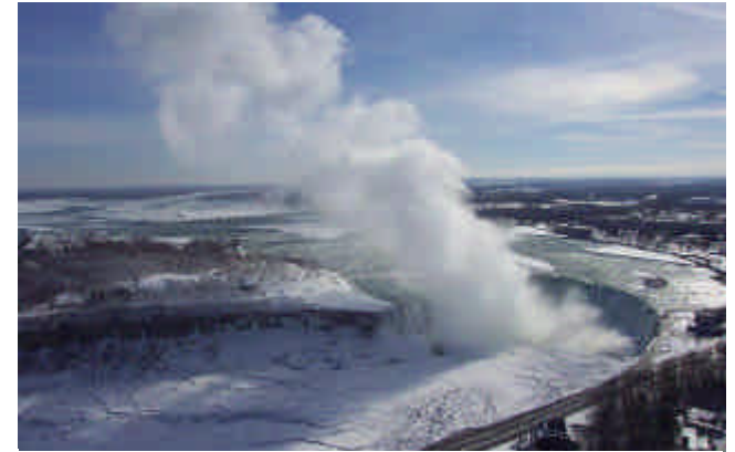
Upstream (South East) Horseshoe Falls