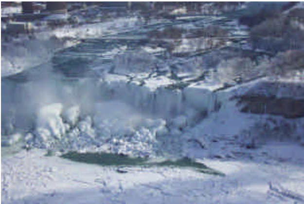
Close-up American Falls