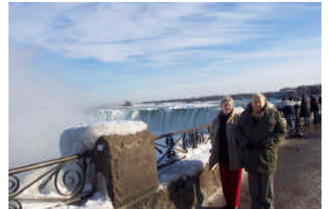
On the ground at the Horseshoe Falls