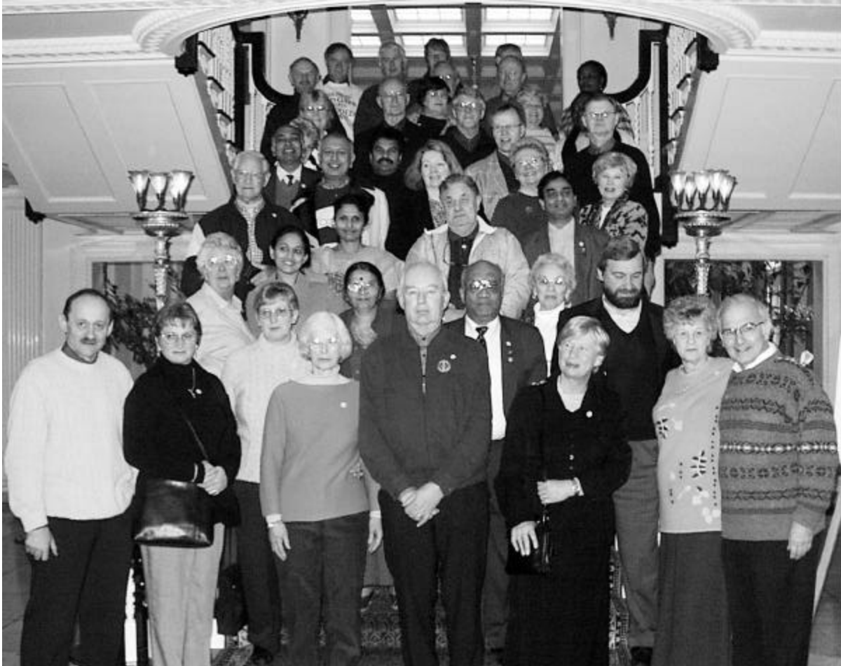
Photo taken on the Grand Staircase of George Eastman's Home which is part of the Museum. George Eastman was the founder of Eastman Kodak Co.