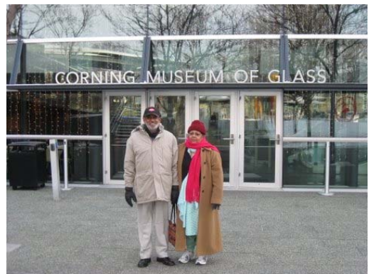
GV and Mena at Corning Glass Center