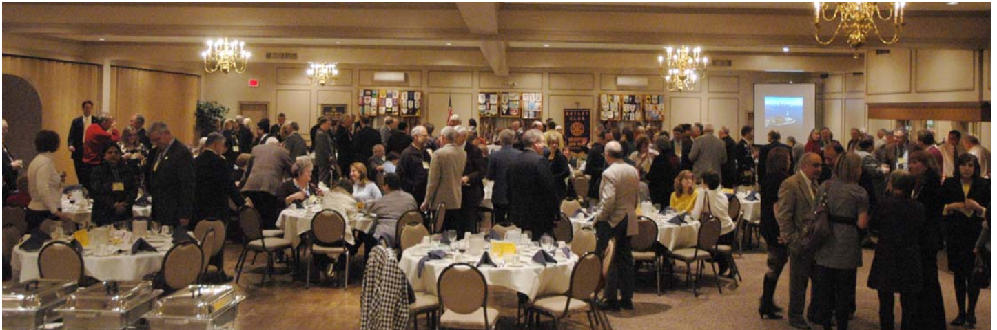
A record crowd fills both dining rooms of the Genesee River Restaurant in Mt Morris giving the guests and hosts an opportunity to meet. Many long lasting friendships are made here and carried on the International Assembly and years beyond.