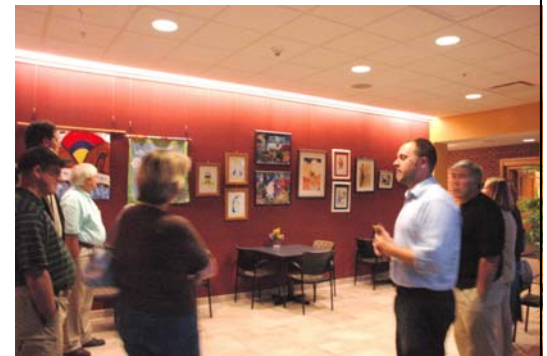
Art Therapy Room